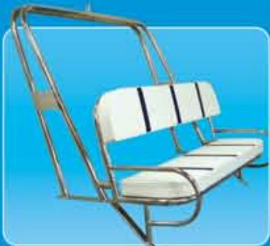
A-Frame with Back Seat