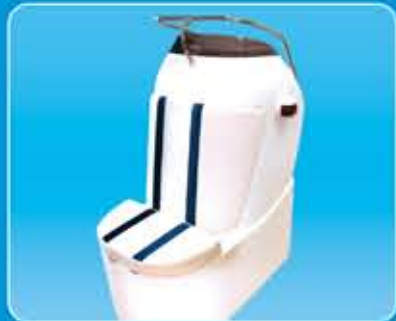
Single Futura Console