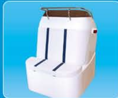
Double Futura Console