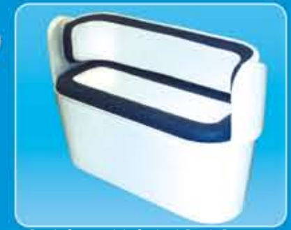
Back Seat with Swivel Back Rest