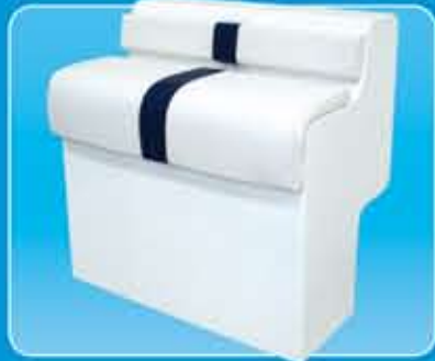
FG Leaning Post