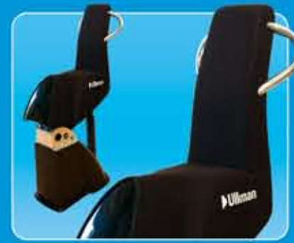
Suspension Seat by Ullman